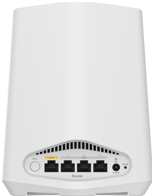
Orbi Pro WiFi 6 Mini Router (SXR30)