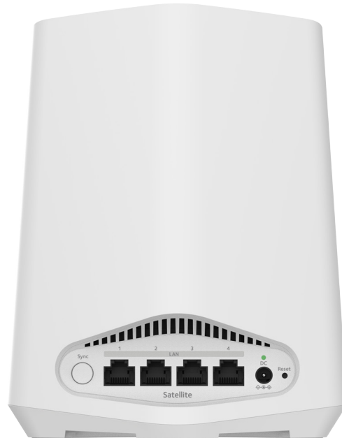
Orbi Pro WiFi 6 Mini Satellite (SXS30)